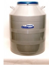
TALOR WHARTON LS4800 Liquid Nitrogen Tank