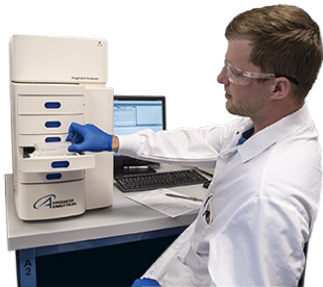
ADVANCED ANALYTICAL Fragment Analyser