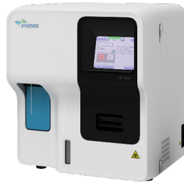
SYSMEX XP300 Haematology Blood Count Analyser