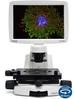
EVOS Fluorescent Microscope