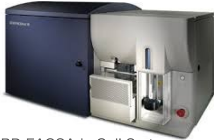
BD FACSAria Cell Sorter