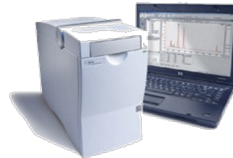
AGILENT 2100 Bioanalyser