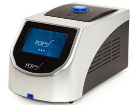
384-well PCR block