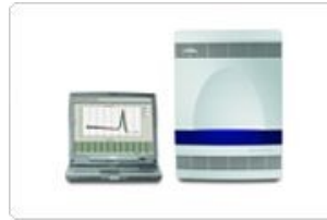
ABI 7500 Real Time PCR Machine